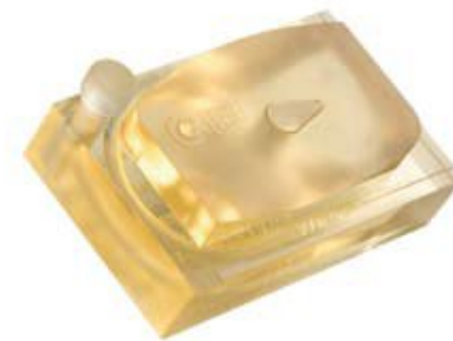
*See Objet Hearing Aid brochure